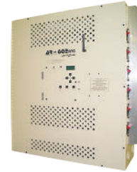
AR602 Wall Mount Dimmer

Flexible, powerful, and affordable, this easy to install and use architectural system is equally at home in churches, schools, theaters, hotels, etc.