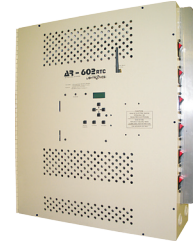
AR602 Wall Mount Dimmer

Flexible, powerful, and affordable, this easy to install and use architectural system is equally at home in churches, schools, theaters, hotels, etc.